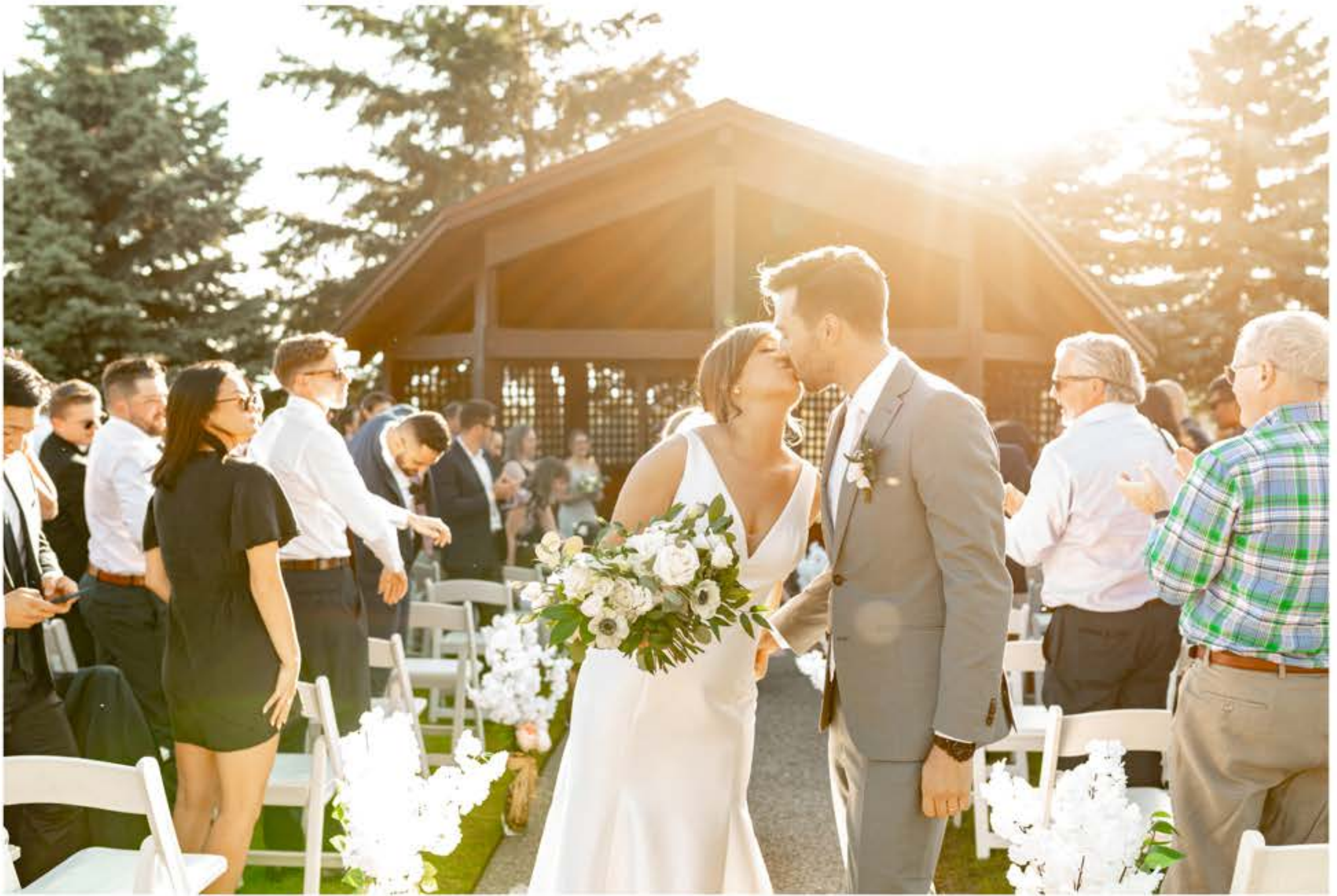
Danae Marie Photography